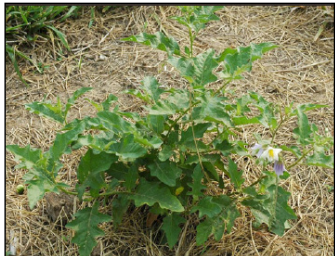
Horsenettle: warm season perennial. Controlled in late summer.