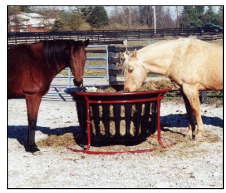
Heavy Use Pads provide a safe, dry place for hay feeding or loafing during wet weather or when pasture productivity is limited.