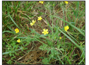
Buttercup: prolific reseeding annual or perennial. Control in late winter, before flowers are visible.

Drill a total of 30–40 lbs. of seed in two directions late August to early September.