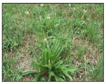
Plantain: cool season perennial. Edible, but limited yield, best controlled in fall or spring.