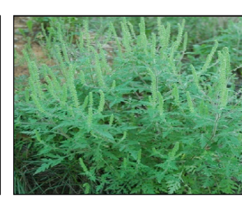
Common Ragweed: warm season annual. Controlled in summer with herbicides or aggressive mowing.