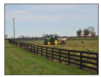
Fall nitrogen extends fall grazing, boosts winter survival and encourages early spring green up.