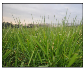
Endophyte infected tall fescue can cause prolonged gestation, dystocia and agalactia when grazed by late term mares.

Educational programs of Kentucky Cooperative Extension serve all people regardless of economic or social status and will not discriminate on the basis of race, color, ethnic origin, national origin, creed, religion, political belief, sex, sexual orientation, gender identity, gender expression, pregnancy, marital status, genetic information, age, veteran status, or physical or mental disability.