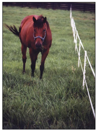
Electric fence is an effective and inexpensive way to begin rotational grazing.