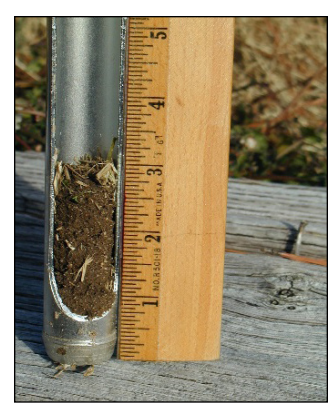
Pastures should be soil sampled to a depth of 3-4 inches using a soil probe.