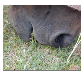
Close and frequent grazing weakens sods, resulting in a pasture that is less productive and more susceptible to erosion and weed encroachment.

Bluegrass Equine Digest. The Bluegrass Equine Digest is a free, award-winning, monthly electronic newsletter dedicated to providing up-to-date information on equine research from the University of Kentucky's College of Agriculture, Food and the Environment. Sign up by visiting TheHorse.com and click "newsletters".