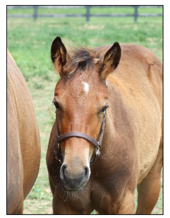
Healthy pasture sods provide a safe exercise surface for both growing and mature pleasure horses.