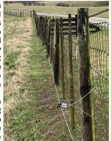
Figure 1. Electrified offsets can breathe new life into an old fence. They control livestock, extend the life of an existing fence, and allow for further subdivisions using temporary fencing.

Use wood post offsets at beginning and end of runs and on problem posts. I like to use a more rigid wood post offset at the beginning and end of runs. This helps to get the offset wire away from the existing fencing (Figure 3). I also like to use these offsets on problem posts with in the run, like old railroad ties that have the existing fencing wrapped around them (Figure 4).