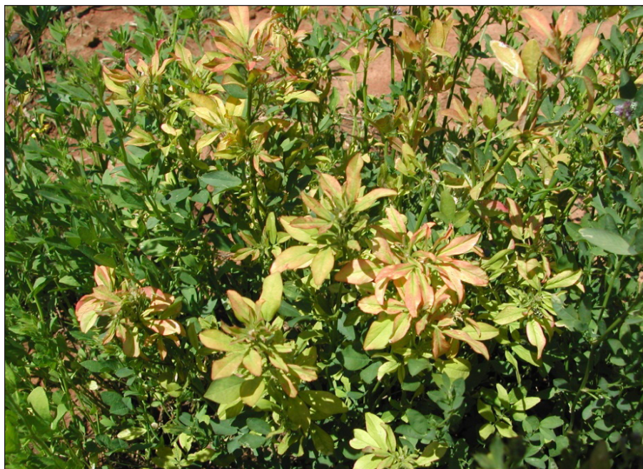
Figure 3. Boron deficiency symptoms in alfalfa.

Luxury consumption of potassium by forage crops is a phenomenon that should be understood by all forage producers. Simply put, luxury consumption refers to the plant uptake of K in excess of the plant needs. This can occur when a plant is supplied with more than adequate amounts of K. When an alfalfa plant is adequately fertilized, the K concentration in the tissue is usually between 2.0 and 3.5 percent. If the soil supply of K exceeds the needs of the crop, tissue K concentrations can be as high as 4.5 percent. For grain crops such as corn or wheat, luxury consumption is not a problem, because excessive K uptake remains in the plant tissue (leaves and stalk) and is returned to the soil with the fodder. For alfalfa and other crops where the entire plant is harvested, excessive K uptake is removed as hay or silage and is not recycled in the soil. Luxury consumption can increase K removal rates to 90 lb K 2 O per ton (55 lb K 2 O per ton is normal removal). The main drawback to luxury consumption of K is that fertilizer applied to increase soil test K can be immediately removed with the first harvest, resulting in lower than optimum soil test K levels for subsequent harvest.