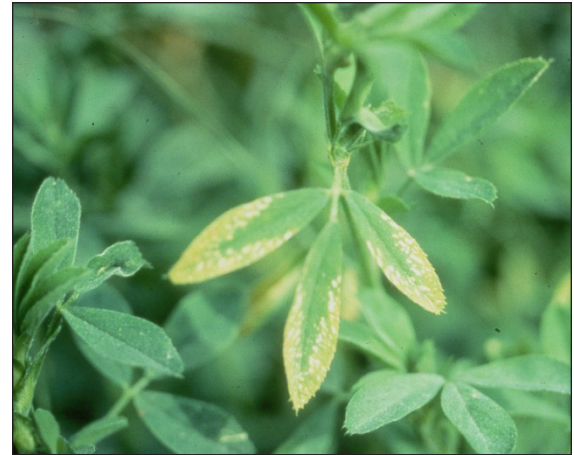
Figure 2. Potassium deficiency symptoms in alfalfa.

University research has shown that yield is not nutrient-limited when soil test levels are above 50 lb P per acre and 300 lb K per acre. Once these soil test levels have been reached, K fertilization can be based on annual crop removal or annual soil test values reported in AGR-1. In addition, AGR-1 recommends fertilization until soil test values (for the composite field sample) are 60 lb P per acre and 450 lb K per acre (Table 1). When a producer follows K recommendations in AGR-1, soil test K values will eventually stabilize at values near 300 lb K per acre. If a producer chooses to apply K based on crop removal, a good rule of thumb is that one ton of alfalfa can remove approximately 14 lb per acre P 2 O 5 and 55 lb per acre K 2 O at standard harvest moisture. A producer can apply rates of fertilizer based on the above values and tonnage of hay removed per acre. For example, if the soil test K level is between 300 and 450 lb per acre and 4 tons of hay are harvested, then 220 lb of K 2 O would be added to replace the amount removed in the harvested hay.