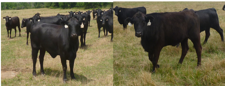
Figure 1. Comparison of 2-year-old brangus heifers bred on seedhead suppressed (left) and unsuppressed (right) pastures. Hair coat length and roughness is usually the most visually distinguishable characteristic of cattle suffering from fescue toxicosis.