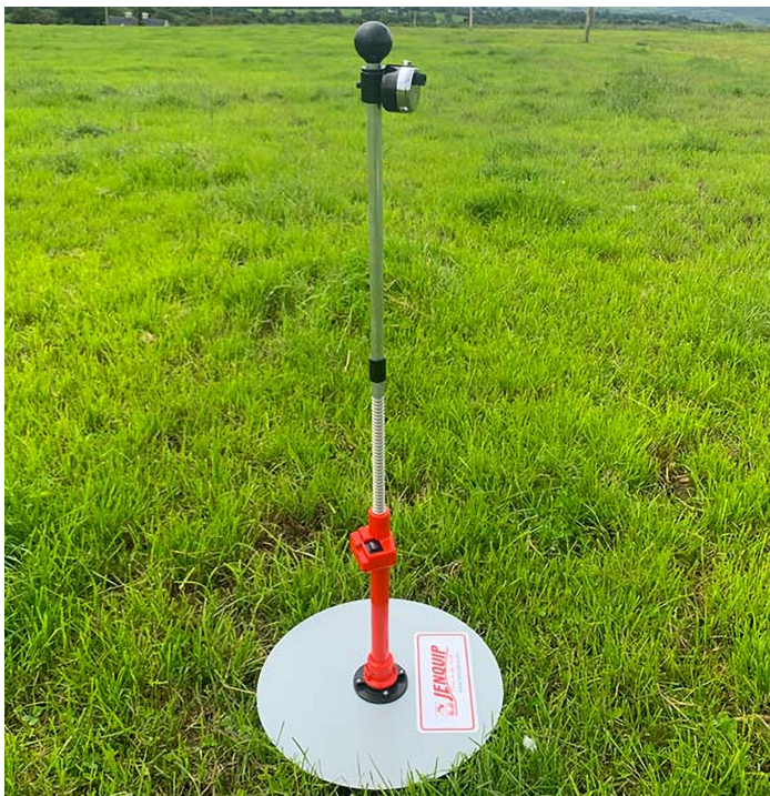
Figure 1. Plate meter made by Jenquip.

A plate meter consists primarily of a weighted plate that moves up and down a shaft as the plate is placed over the sward. The forage is then compressed until it can support the weight of the plate. The distance from the point where the shaft contacts the ground and the plate is referred to as the plate height. Plate meters can be called by several names, such as falling, resting, weighted disk, or rising plate meters.