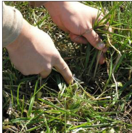
Figure 1. Tillers must be cut at the soil surface.

The best ways to determine the level of infection within a stand is to examine individual tall fescue tillers sampled from the field microscopically for evidence of the fungus or to use a recently developed immunoblot laboratory procedure. In Kentucky, the Division of Regulatory Services, located at the University of Kentucky, offers a service to test tall fescue infection level. To obtain useful information samples must be collected in accordance with the guidelines given here.